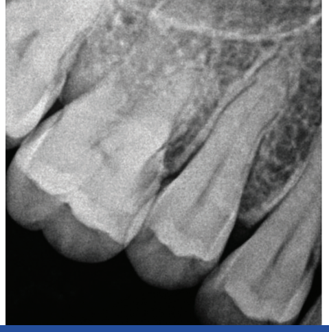
[Table/Fig-2]: Intraoral periapical radiograph depicts slight PDL widening in relation to 15 region with no evident bone loss in the 15, 16 regions. PDL: Periodontal ligament

An informed written and video consent was taken prior to any intervention, including non surgical therapy i.e., scaling, root planing,