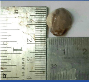
[Table/Fig-3a]: Excision of the lesion at the palatal site. [Table/Fig-3b]: Macroscopic appearance of the lesion; the excised lesion measured about 1.5×1.4 cm in length and diameter.