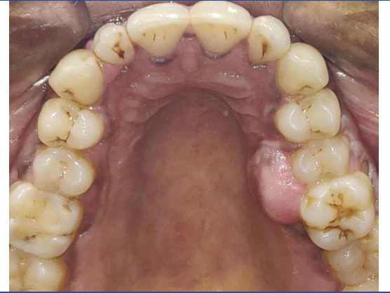
[Table/Fig-1]: Clinical presentation of the lesion on the gingiva of the hard palate.

On clinical examination, there was a pedunculated mass on the right posterior aspect of the hard palate in relation to the distal aspect of 14 extending to mesial aspect of 16 [Table/Fig-1]. The lesion was approximately 1.5×1.2 cm in size, normochromic, and had a smooth surface. It had been present for two months. On palpation, the lesion was firm in consistency, non tender without any history of bleeding. Based on the history and clinical examination, a provisional diagnosis of fibroma was made.